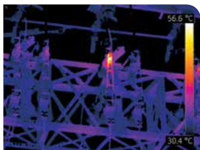
Overheating substation circuit breaker